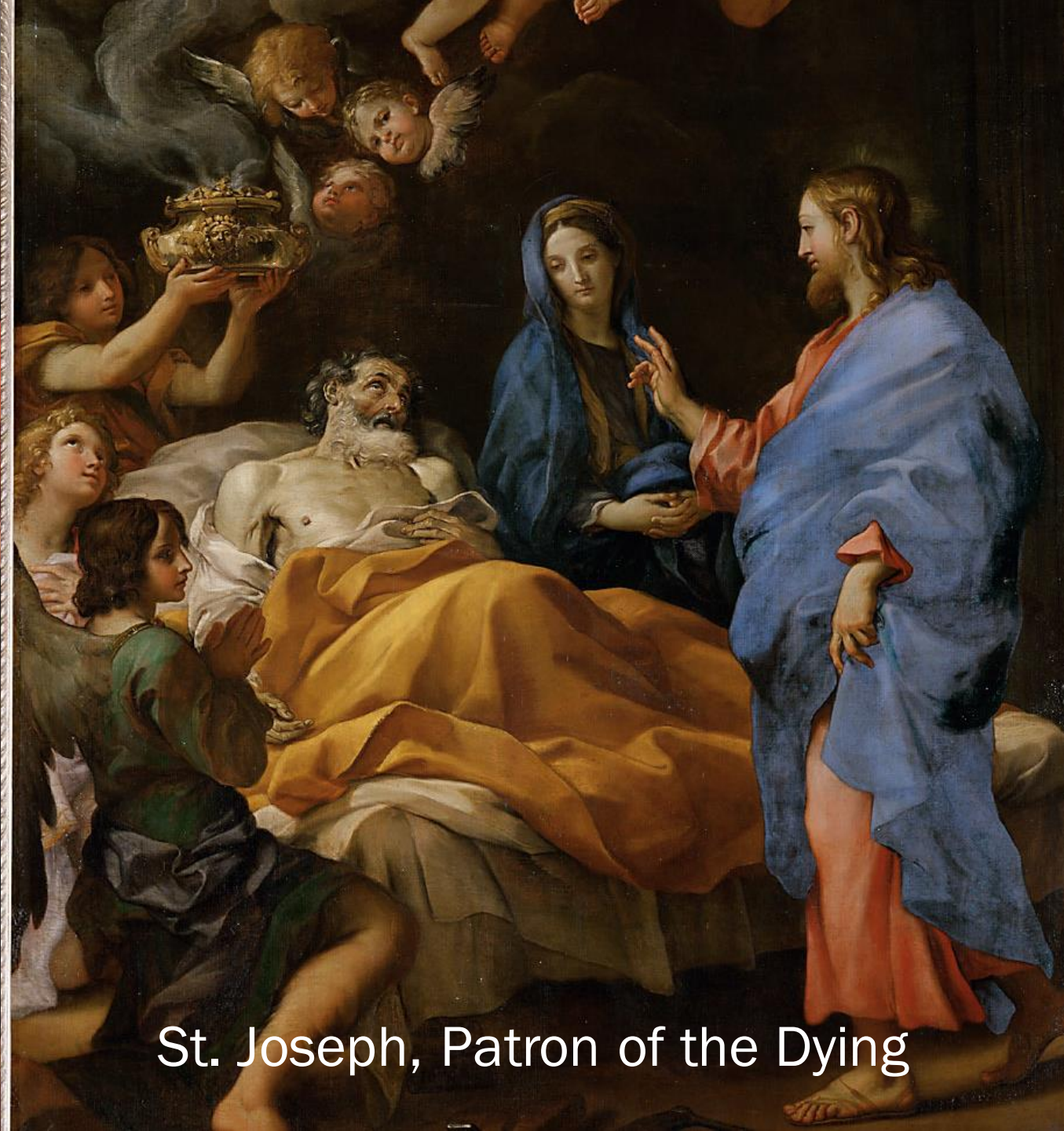
St. Joseph, Patron of the Dying