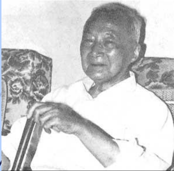
Cardinal Kung released from prison while being processed to be put in house arrest in 1985.